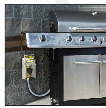
Hose Assembly Length Restrictions May Apply: Check with Local Jurisdictions

* Connect / Disconnect are Denied While Gas is Flowing.